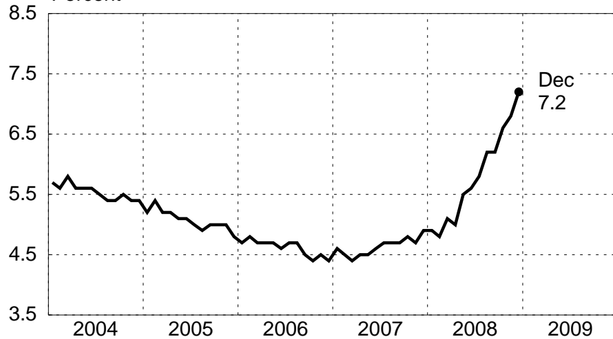
Unemployment Rate Percent