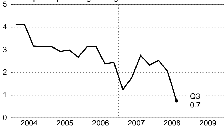
Gross Domestic Product Four-quarter percentage change